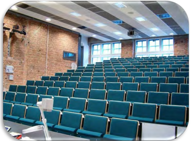
Auditorium van de Tweede Hoofdwet

For more information: elke.deckers@kuleuven.be